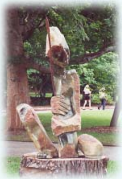
The Last Warrior A reflection on the futility of war and conflict.