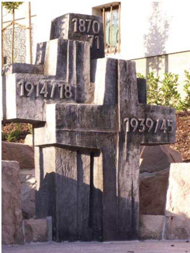
War Memorial in Waldaschaff, Germany