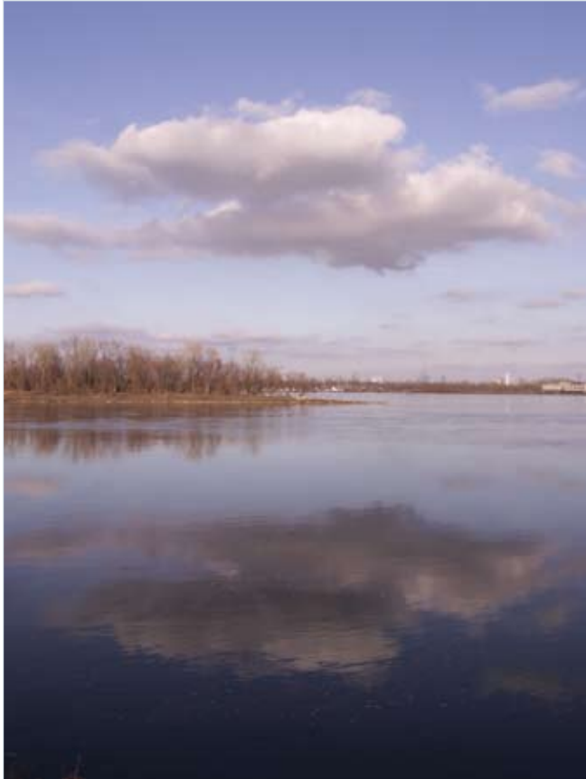
Confluence of Missouri and Mississippi Rivers

The first peace, which is the most important, is that which comes within the souls of people when they realize their relationship, their oneness with the universe and all its powers, and when they realize that at the center of the universe dwells the Great Spirit, and that this center is really everywhere, it is within each of us.