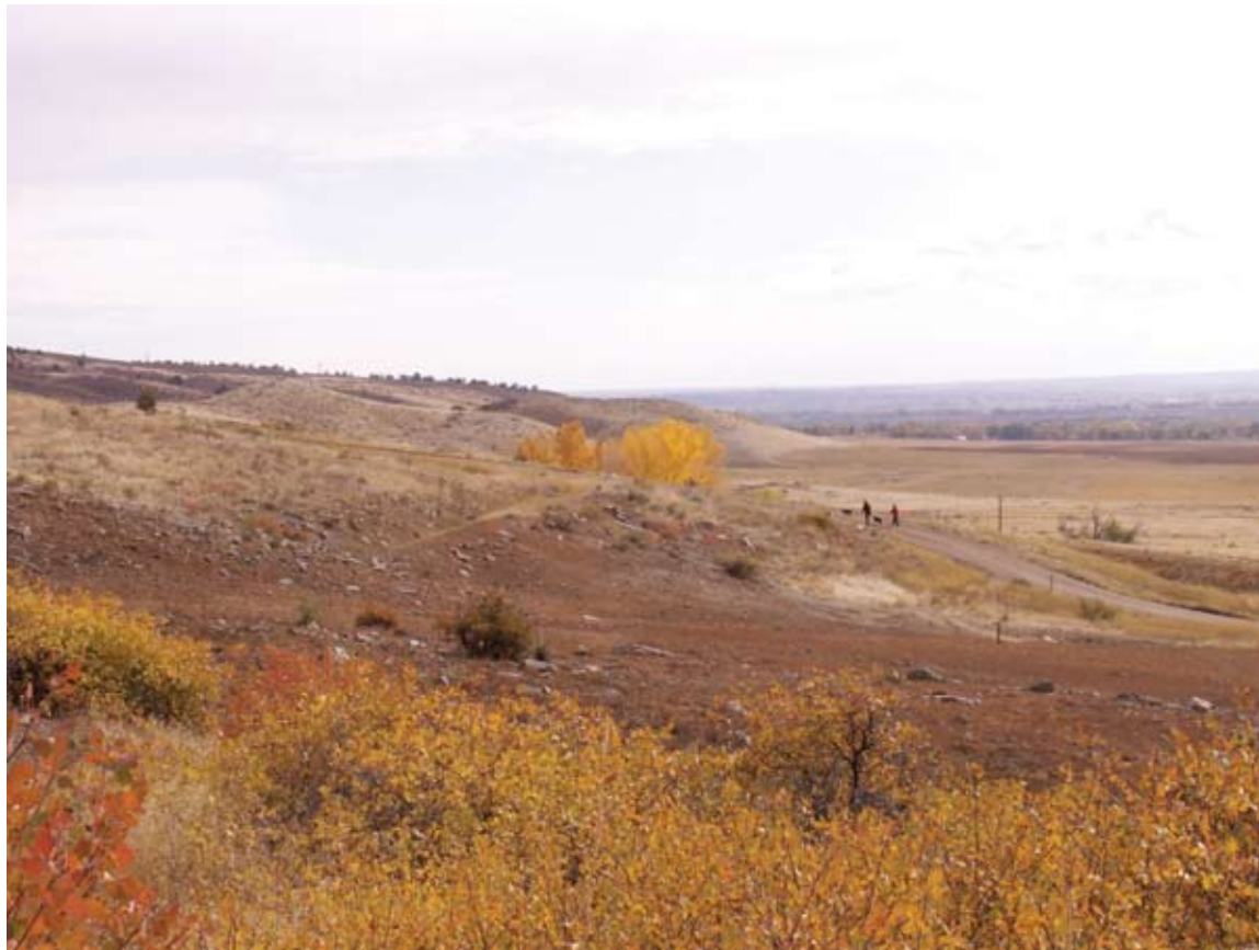
Rabbit Mountain, Colorado