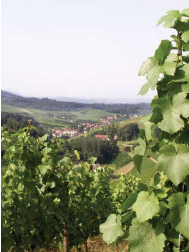
Durbach, Baden, Germany

Peace is the marriage of the people and the planet, with all attendant vows.