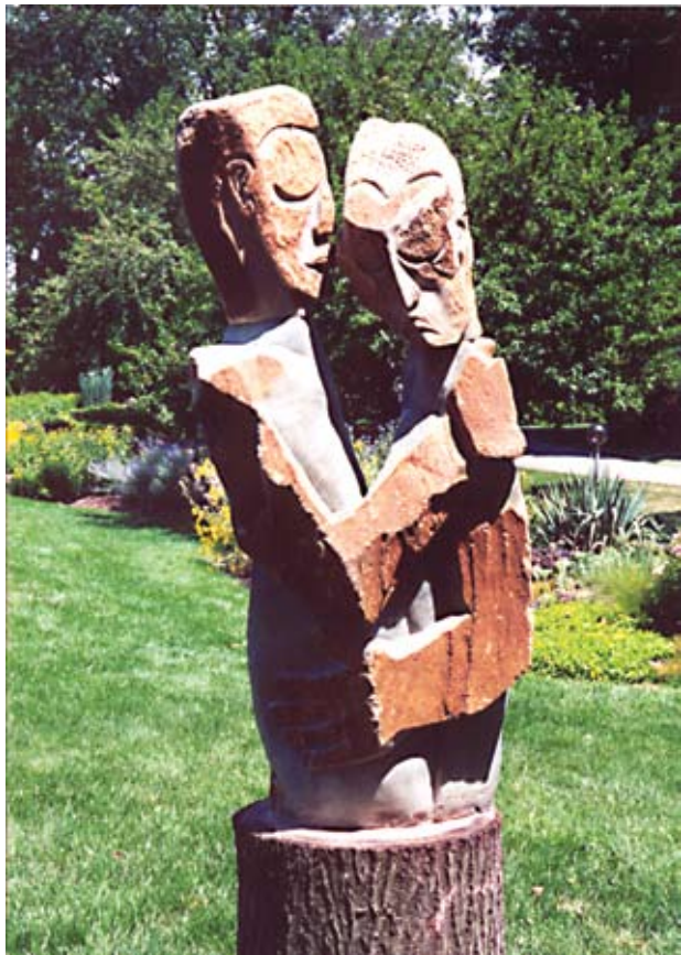
“Consoling” from Chapungu exhibit at Missouri Botanical Gardens, St. Louis, Missouri

If we have no peace, it is because we have forgotten that we belong to each other.